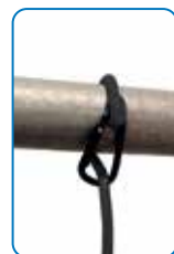
Built-in strap with strong magnet and hook for suspension