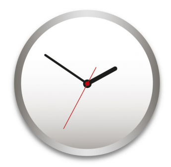
Long operating life

A light source you can trust. The LED bulb, delivered with this Philips LED lamp, will last up to 25.000 hours (which equals 25 years on basis of an average use of 3 hours / day with an amount of at least of 13.000 on/off switching cycles). It feels so comfortable to think that you won't have to worry about maintenance or light bulb replacement while having the perfect light ambiance in your home.