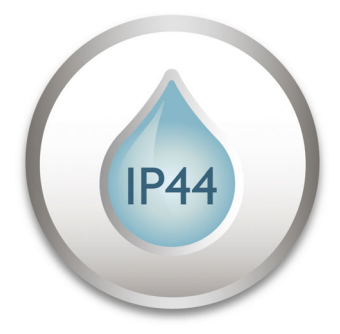
IP44 - weather proof

This Philips outdoor light is especially designed for humid outdoor environments. It was tested rigorously to ensure its water resistance. The IP level is described by two figures: the first one refers to the protection level against dust, the second against water. This outdoor light is designed with IP44: it is protected against splashing water, this product is most common and ideal for general outdoor use.