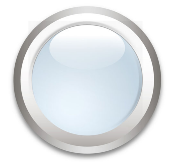
Cool white light

Light can have different color temperatures, indicated in units called Kelvin (K). Lamps with a low Kelvin value produce a warm, more cosy light, while those with a higher Kelvin value produce a cool, more energising light. This Philips light offers cool white light that keeps you energised.