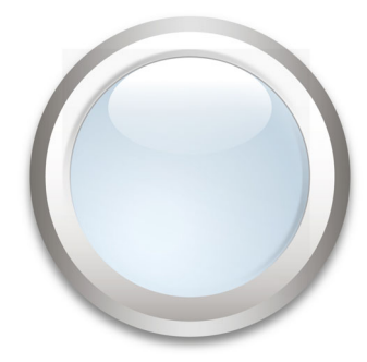
Cool white light

Light can have different color temperatures, indicated in units called Kelvin (K). Lamps with a low Kelvin value produce a warm, more cosy light, while those with a higher Kelvin value produce a cool, more energising light. This Philips light offers cool white light that keeps you energised.