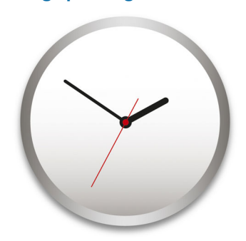
Long operating life

A light source you can trust. The LED bulb, delivered with this Philips LED lamp, will last up to 25.000 hours (which equals 25 years on basis of an average use of 3 hours / day with an amount of at least of 13.000 on/off switching cycles). It feels so comfortable to think that you won't have to worry about maintenance or light bulb replacement while having the perfect light ambiance in your home.