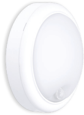
1 ProjectLine Wall-Mount Round

Energy efficient, professional quality LED wall-mounts with motion sensor.