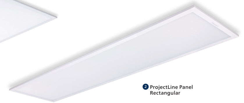
2 ProjectLine Panel Rectangular