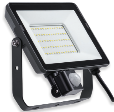
2 ProjectLine Floodlight with sensor