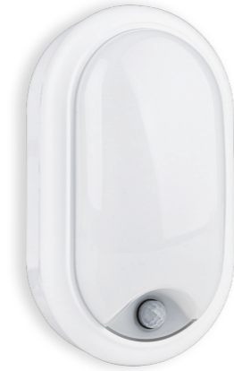
2 ProjectLine Wall-Mount Oval