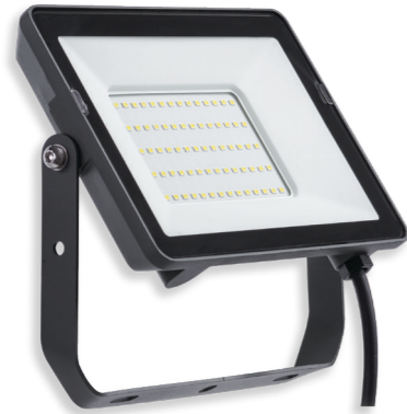
1 ProjectLine Floodlight

Pro grade LEDs in varied lumens and sensor strengths.