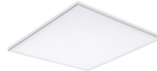
1 ProjectLine Panel Square

Reliable, energy efficient professional LED panels in three sizes.