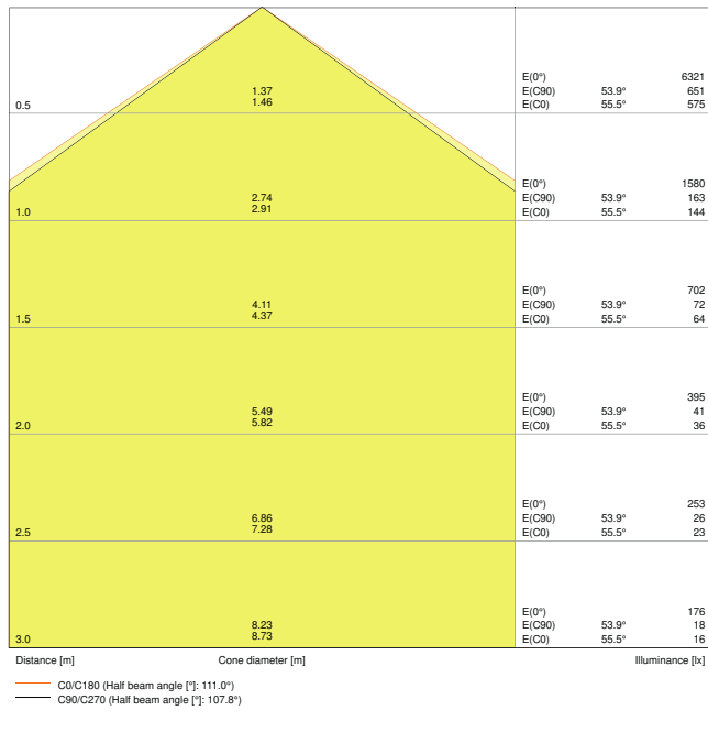
LDC typ cone